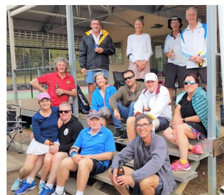
Wompoos and Wikings

We played some impressive tennis against some very good opposition and did manage to achieve 2 good wins, 2 very tight matches, with only a couple of sets the difference and one equal on sets and losing by 4 games. Covid threw us a curve ball as we were unable to play our return grudge match against the famed Wikings team. However, that can wait again until next year.