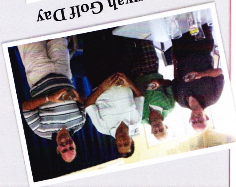
Beerwah Golf Day