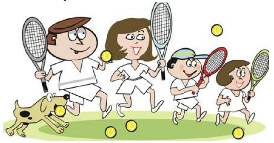
Friday Evenings 6.45pm Cost $20.00